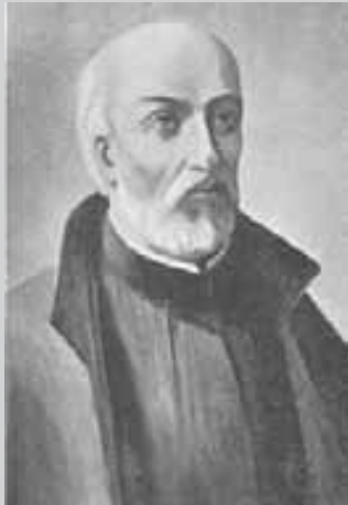
St. John de Brebeuf