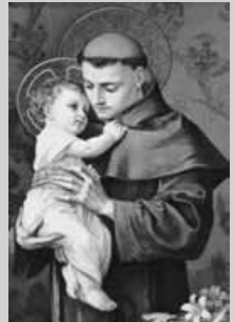
St. Anthony of Padua

Masses: Saturday 5:00 p.m. Sunday 8:30 a.m.